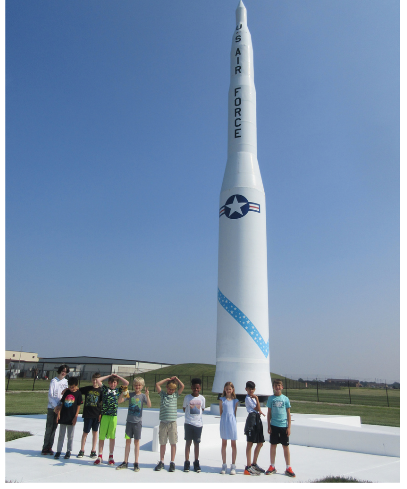
The Oscar 1 tour was a blast and the kids had a great time.