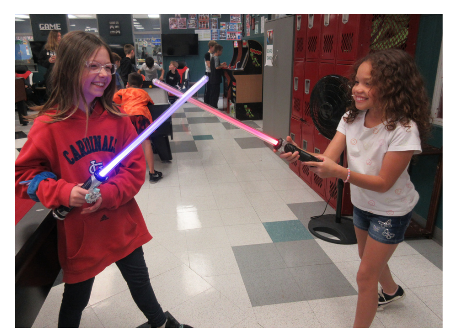
Open Rec is having a fun adventurous day playing with light up lightsabers.